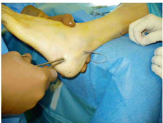
Fig. 6 This is a lateral view of the tonsil hemostat inserted from the inferior lateral incision site. The tonsil hemostat should be directed superiorly against the lateral aspect of the wall of the calcaneus. Once the tips of the tonsil hemostat exit out of the superior lateral incision site, the assistant surgeon should place the loop of the gigli saw into the jaws of the tonsil hemostat. The tonsil hemostat should be rotated one quarter turn so that the loop of the gigli saw lies flat against the wall of the calcaneus as it pulled from superior - inferior on the lateral aspect of the calcaneus and exiting through the inferior lateral incision site