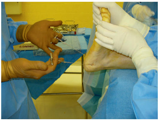
Fig. 7 The surgeon has the gigli handles hooked to the gigli saw with tension; at this time an intraoperative lateral view should be taken to be sure this is the desired position of the gigli saw for the proposed osteotomy

saw and demonstrate the angle of the proposed osteotomy. Check to be sure there are no kinks in the saw and that the saw is in the desired placement. It is now time to perform the osteotomy. The placement of the incisions ensures that the osteotomy is performed in the proper plane which should be inclined posteriorly at 45 ^{\circ} to the plantar surface of the rear foot (Fig. 8).