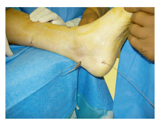
Fig. 5 From the medial view of the calcaneus, the straight hemostat is entered from the lateral superior aspect of the calcaneus and exiting out of the medial, superior calcaneus. The assistant should place the loop of the free end of the giggle saw into the jaws of the straight hemostat. The straight hemostat then will bring the giggle saw across the superior aspect of the calcaneus and exiting out of the superior, lateral incision site