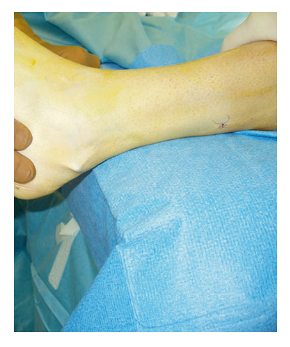
Fig. 4 This is a lateral view of a straight hemostat coming from medial to lateral tenting the skin prior to making an incision superior and lateral on the lateral aspect of the foot. The hemostat should tent the skin anterior to the Sural Nerve and Peroneal Tendons and posterior to the Achilles Tendon to identify the "safety zone" prior to making the lateral superior incision