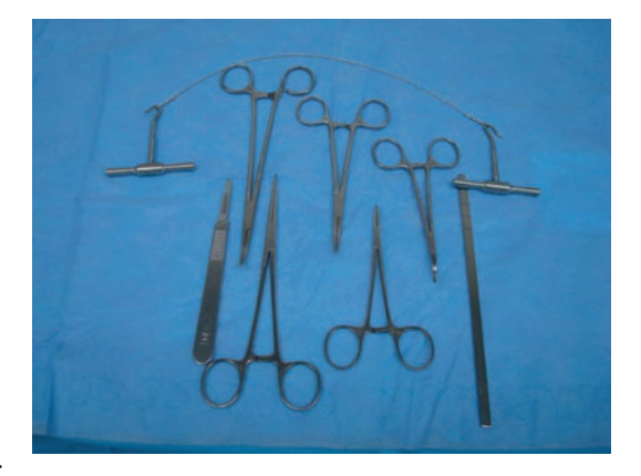
Fig. 1 The needed equipment consist of a flexible gigli saw and handles. A large curved and a small curved hemostat, a large straight and a small straight hemostat, a tonsil hemostat, and a quarter-inch osteotome

There are a number of structures to be concerned with on the medial aspect of the calcaneus when performing a calcaneal osteotomy. On the lateral aspect, the sural nerve and its branches are in the vicinity of the calcaneal displacement osteotomy. The peroneal tendons are on the lateral aspect of the calcaneus; however, they are more anterior to the osteotomy; therefore, the peroneal tendons are not a concern while performing the percutaneous posterior calcaneal osteotomy. The