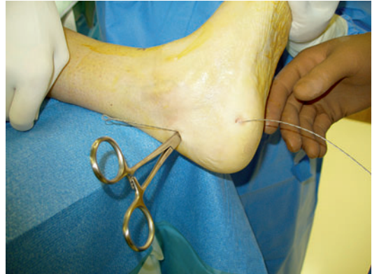
Fig. 3 This is a medial view after the gigli saw has been passed through from superior medial to inferior medial. A straight hemostat is used entering into the superior medial incision site and is inserted from medial to lateral. It is very important that the surgeon uses the tips of the straight hemostat to maintain contact with the superior aspect of the calcaneus as the hemostat is directed from medial – lateral

Make the fourth stab incision at the lateral inferior incision mark along the lines of the proposed osteotomy just slightly inferior to the inferior lateral cortex of the calcaneus and parallel to the medial inferior incision site. Bluntly deepen this incision down to the calcaneal body with a hemostat. Once again make a tunnel superiorly toward the superior incision, being sure to keep the tip of the hemostat against the body of the calcaneus and to separate the periosteum from the subcutaneous tissues and neurovascular structures. The incision site and tunnel should be